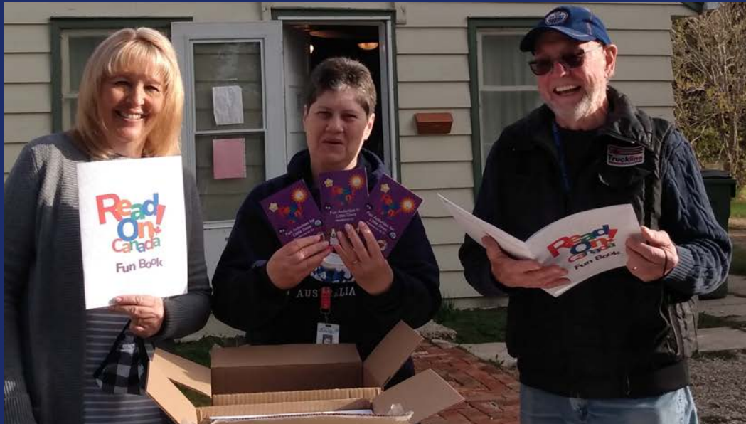
Food banks, literacy groups to distribute 150,000 children's books across Canada this summer, CBC