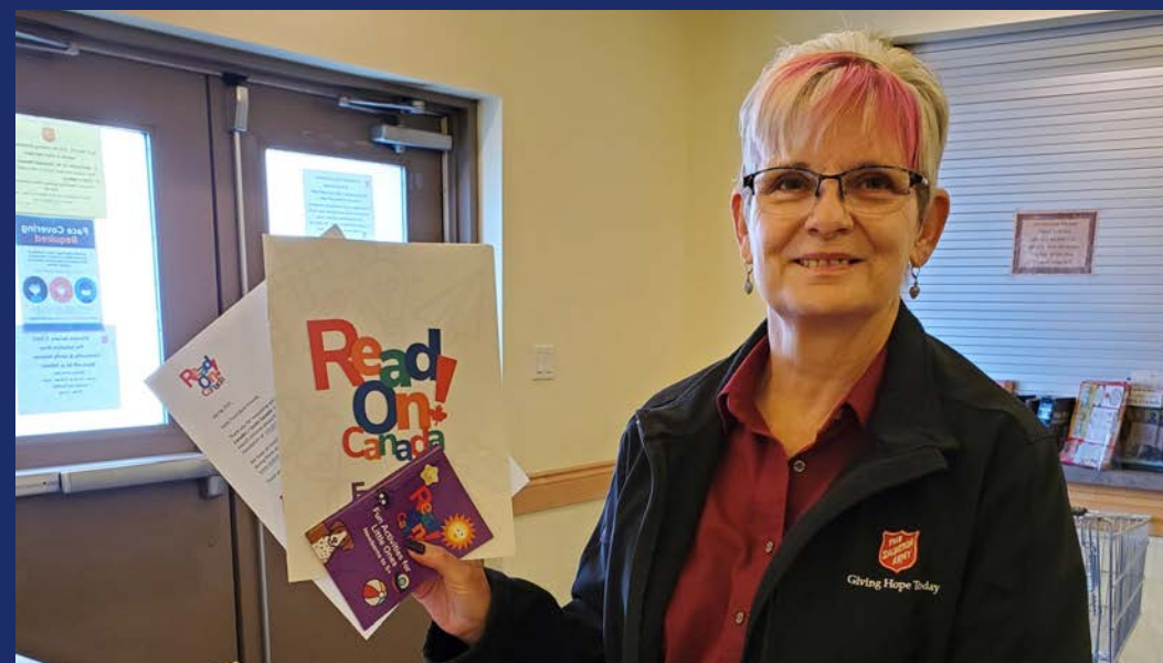
What is one thing we can do about children's learning loss during the pandemic? Put a book in their hands