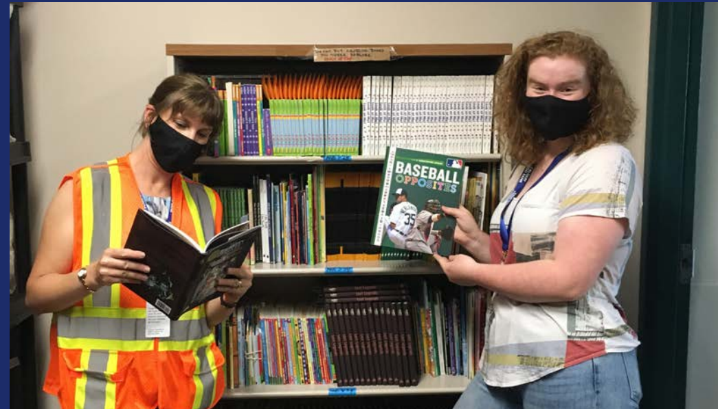
Canadian initiative to donate books to kids during pandemic wins World Literacy Award