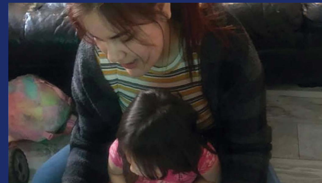
COVID-19 exacerbates the existing crisis of early literacy, Quill & Quire