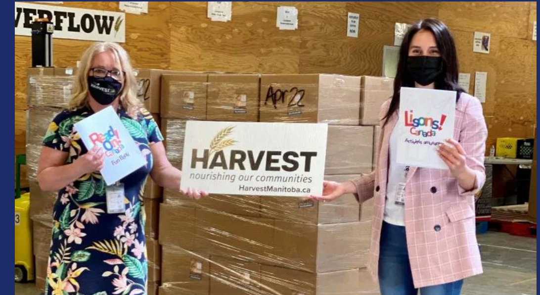
Food banks partnering with literacy groups to distribute books, EatNorth.com