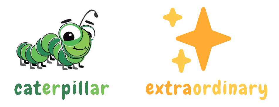
Tip 2: Stretch the word. Try stretching a challenging word into parts to make it easier to read.